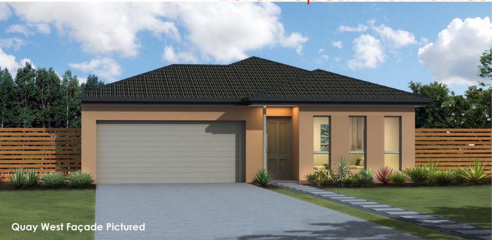
Quay West Façade Pictured