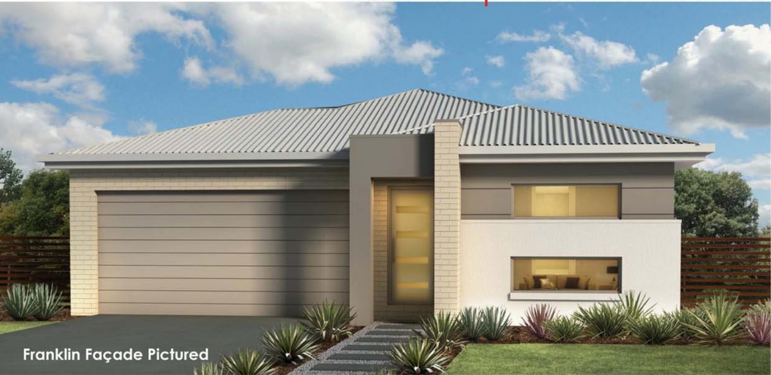
Franklin Façade Pictured