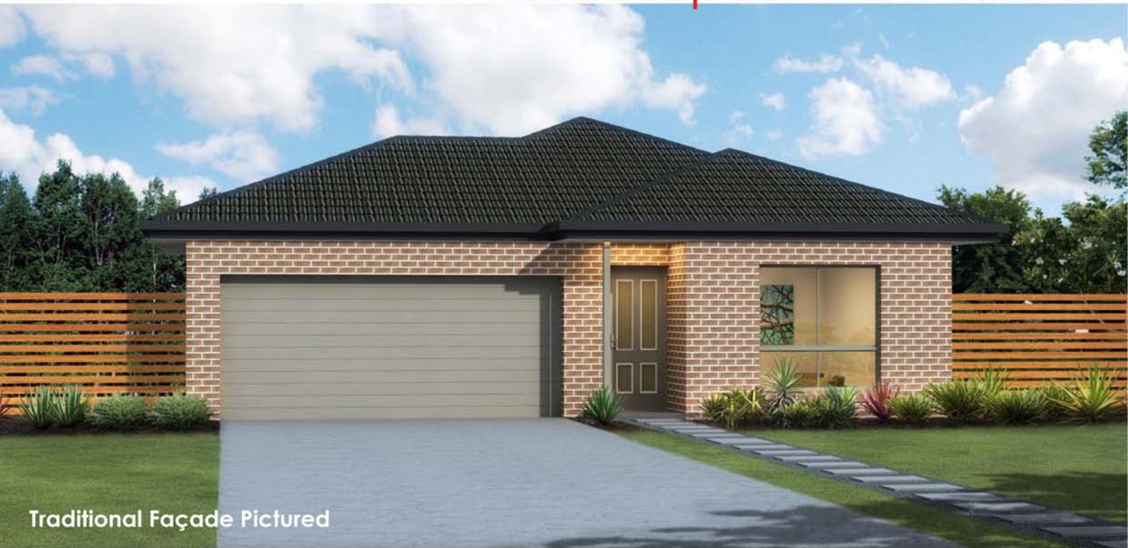
Traditional Façade Pictured